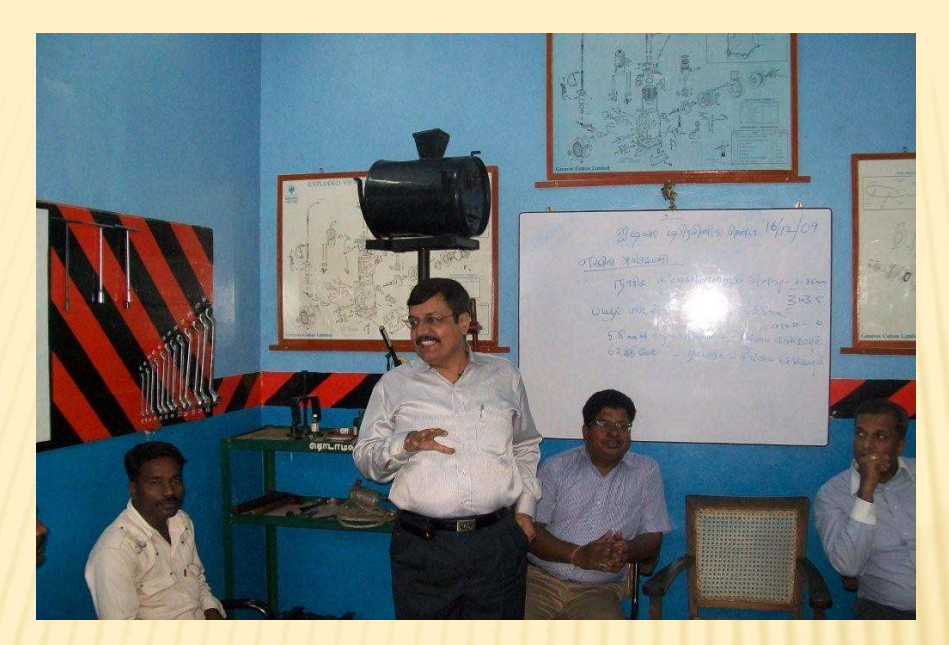
Workshop acquisition-certified garage project